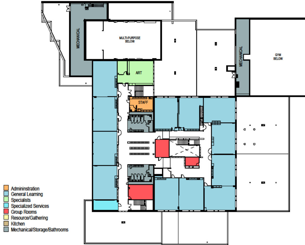
St. Anthony Park Elementary School - Addition & Remodeling - Level 2 Diagram